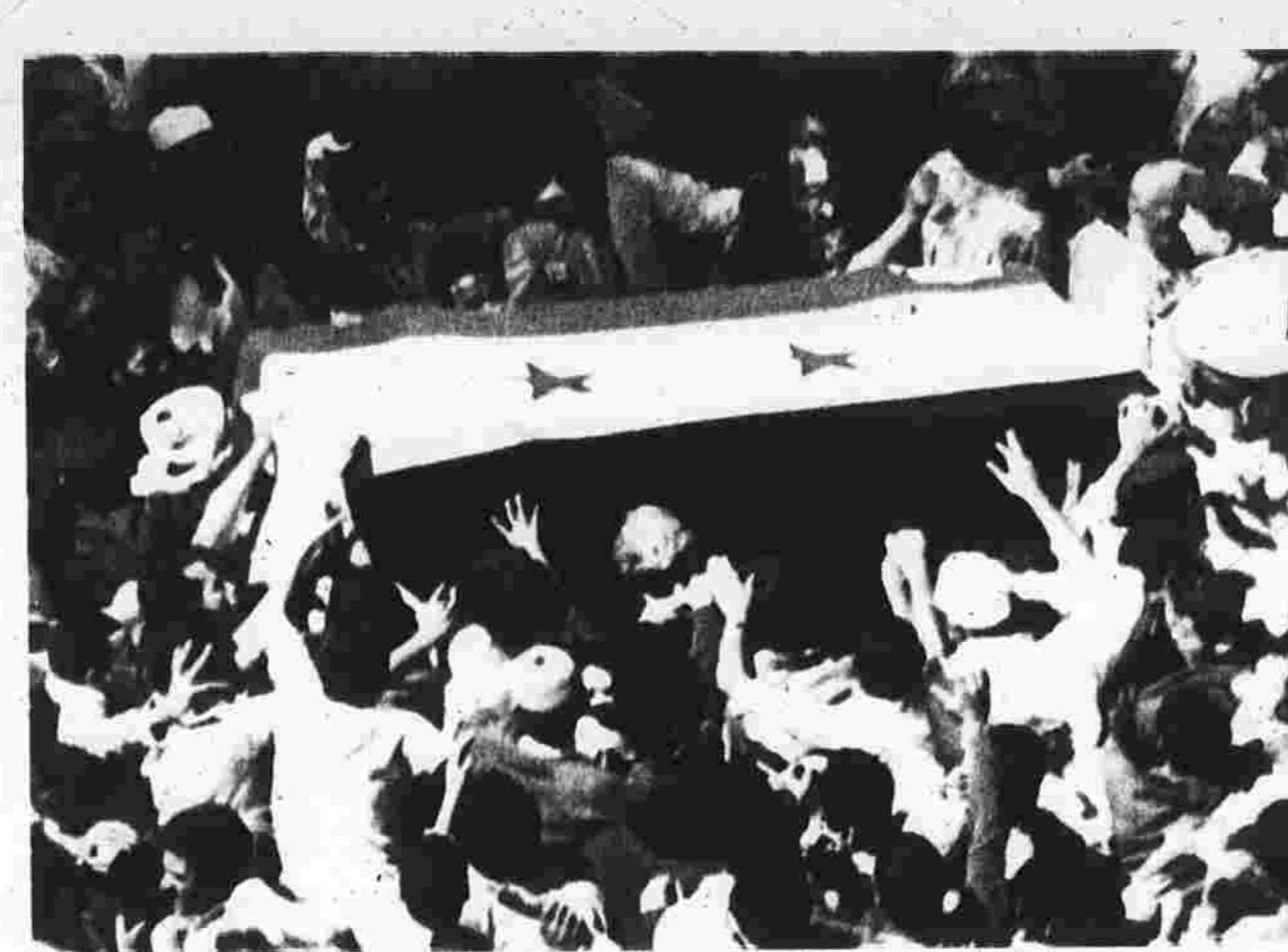
Mourners reach out to touch the flag-draped coffin of late President Nasser as it passes through Cairo yesterday amid scenes of emotional fervor. Crowds tried to snatch his body from the gun carriage and the Egyptian flag was twice torn off his coffin. Several were killed along the funeral route.

WASHINGTON (AP) — The problems with the 747's engines, Federal Aviation Administration officials said today, do not justify the FAA's decision to restrict the use of the aircraft.