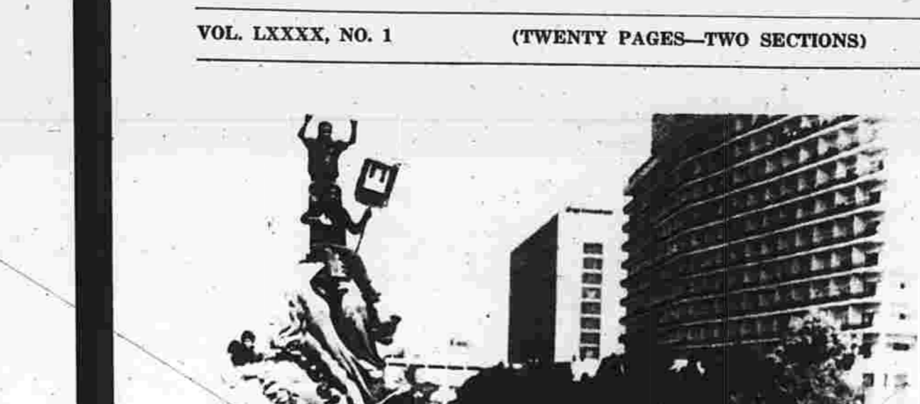
Caisson bearing the body of the late Gamal Abdel Nasser makes its way slowly through throngs that crowd Tahrir (Liberation Square) in Cairo.

CAIRO (AP) — Gamal Abdel Nasser, hero of the Arab world, was laid to rest wrapped in a simple white sheet today after a funeral that provided an emotional explosion for millions of adoring Egyptians.