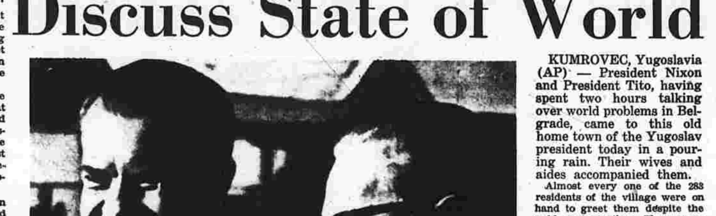
Presidents Nixon and Tito talked over world problems today.

KUMROVEC, Yugoslavia (AP) — President Nixon and President Tito, having spent two hours talking over world problems in Belgrade, came to this old home town of the Yugoslav president today in pouring rain. Their wives and aides accompanied them.