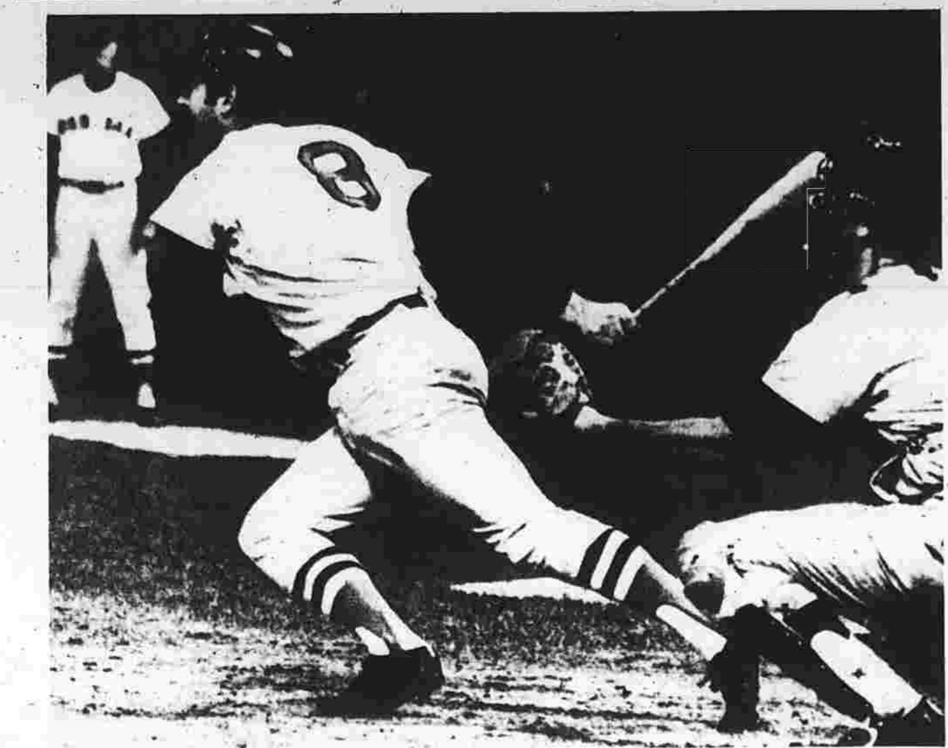
Carl Yastrzemski Lashes Out Final Hit of 1970 Season at Fenway Park